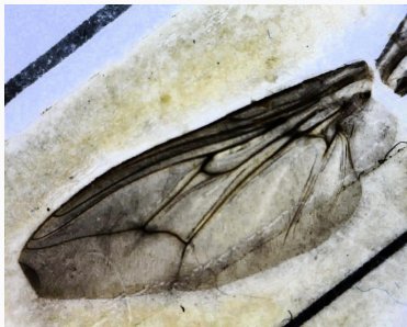
Figure 1: Fly Wing

Fly wing morphometry provides insight in tsetse population genetics, which can be used for large scale studies of population genetics. This aids in the management of tsetse fly populations.